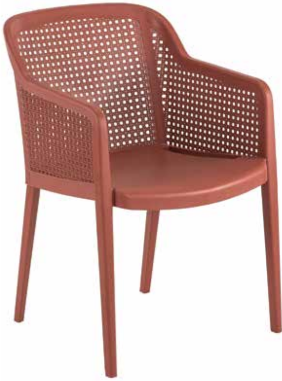
Tile Red 101010539