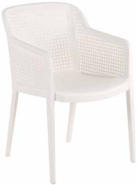
Ivory White 101010535