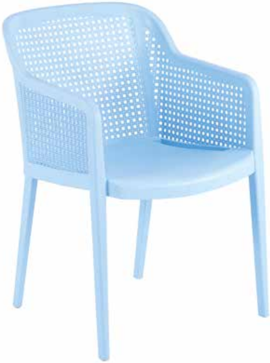
Light Blue 101010543