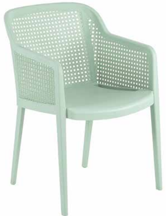
Nile Green 101010538